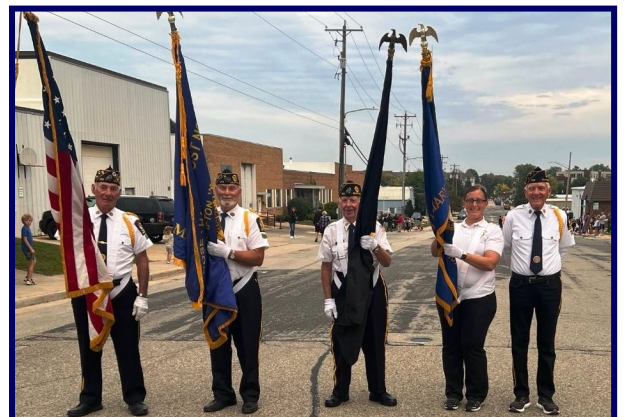
GHS Homecoming Parade