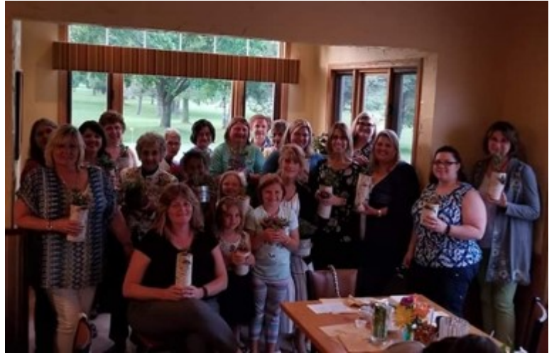
Members with their prizes