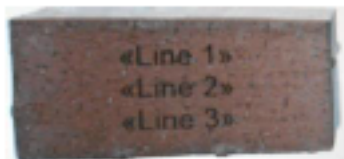
For 4 x 8 bricks

For all bricks , please utilize the boxes below for your message. Please note – utilize only one letter/character per box. Not all boxes/rows need to be filled. If you'd like the engraving centered, please do so below. You will not be sent a proof before your brick is engraved. The brick will be engraved exactly as it appears below. Please print legibly.